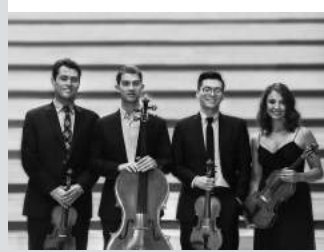
Dover Quartet September 22, 2018