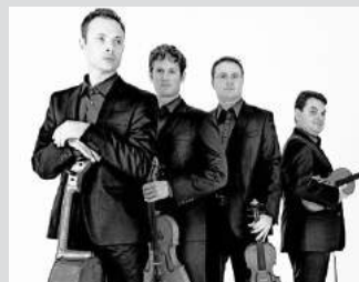
Jerusalem Quartet April 13, 2019