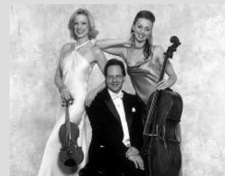
Trio Solisti May 4, 2019