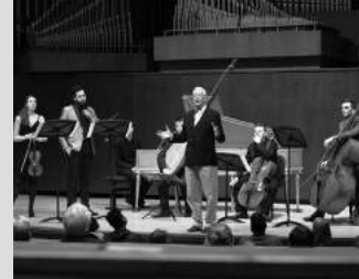
Juilliard Baroque March 30, 2019