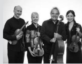
Takács Quartet October 20, 2018